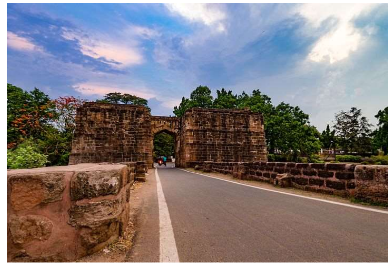
this fort. The fort is spread across an area of 102 acres.